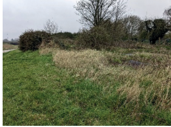
The abandoned Norfolk Brothers Boat Yard, The Friars, King's Lynn