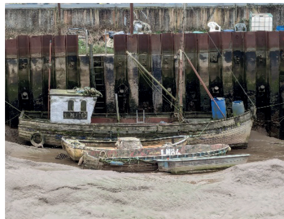
'Am I next?!'