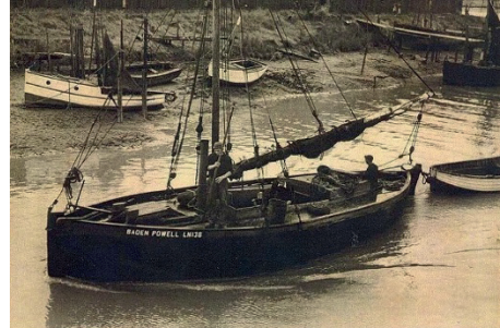
'Baden Powell' leaving the Fisher Fleet about 1950

Keeping a constant eye on the rapidly incoming tide, the crew heaved the last sacks on to the deck and waited to be refloated and to make their way home. They had no modern safety or navigational aids like GPS or depth-sounding equipment. The fisherman of Lynn knew these waters like the backs of their rope, wind- and salt-weathered hands. The crew would negotiate the ever-shifting sands of the inlets back to the Fisher Fleet next to the docks using the landmark towers of Greyfriars Friary, St Margaret's Church and St Nicholas Chapel to find their way home. Greyfriars only survived the purge of