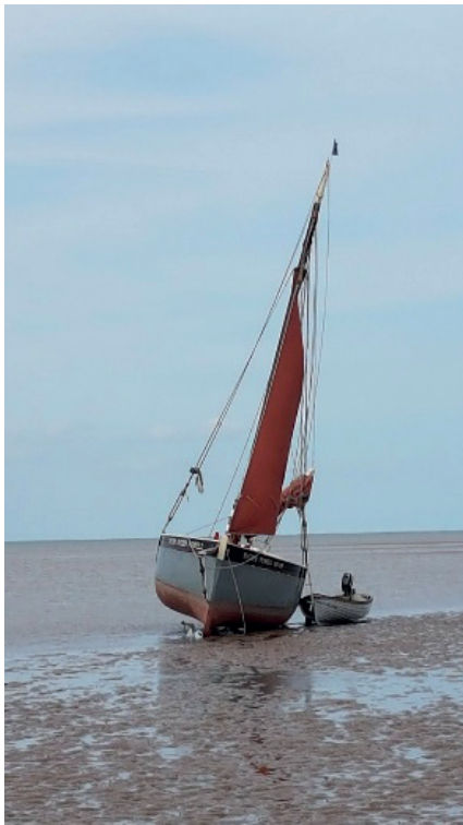
Beached on a cockling trip, for which she was designed

In 2018 the amazing transformation of the Baden Powell from the wreck of an old unwanted fishing boat destined to rot on the quayside, into a once again proud river going craft was complete. She is unique: the last surviving double-ended cockling boat in existence.