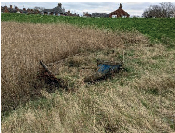
The wreck of a once-proud boat

The Worfolks were known for building high-quality boats and we look at them now as works of art, memories of a romantic bygone age and in need of protection and preservation. Being realistic though, we sadly have to accept that, for a fisherman, a boat was just part of his tool kit and they were, in effect, the 'white vans' of the day. After their useful life, hastened by the transition to metal hulled boats, many were left to rot in the boat graveyard that is the Fisher Fleet or on the banks and quays of the river.