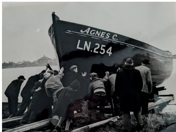
Launching a boat, 1950s style

The Worfolks did not produce drawings or plans for their wooden boats. One of the first skills an apprentice mastered was how to produce a scale model of the boat which would be shown to the prospective customer. When the customer was satisfied with the design, the model would be scaled up to produce the full-sized boat. The models are now highly collectable.