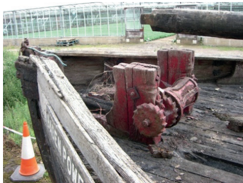
'The deck and bow of 'Baden Powell' before restoration