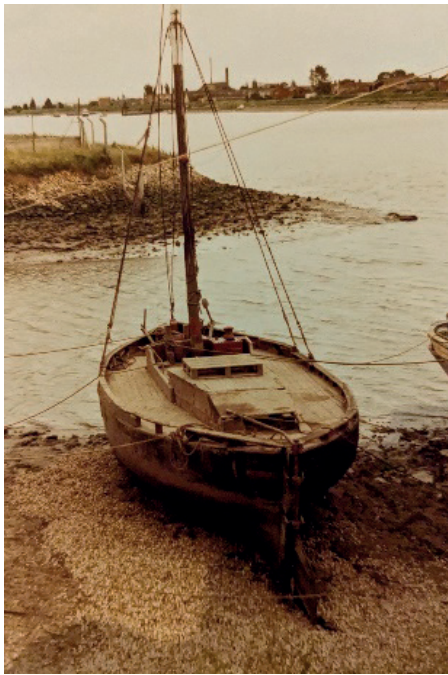
'Baden Powell' in the Fisher Fleet

The skeletons of some of these wonderful boats can still be seen today slowly rotting and sinking into the silt.