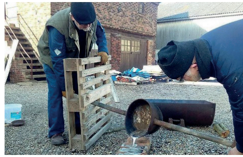
Making lead ballast using a house brick

Now seems a good time to raise the age-old conundrum: is the result of an extensive restoration the same boat or is it a new boat? When restoring the Baden Powell , as many of the original parts were kept if at all possible.