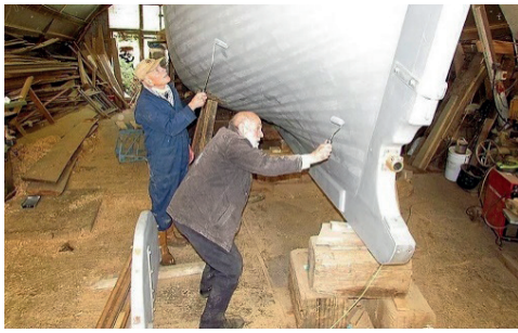
Not another coat of paint!