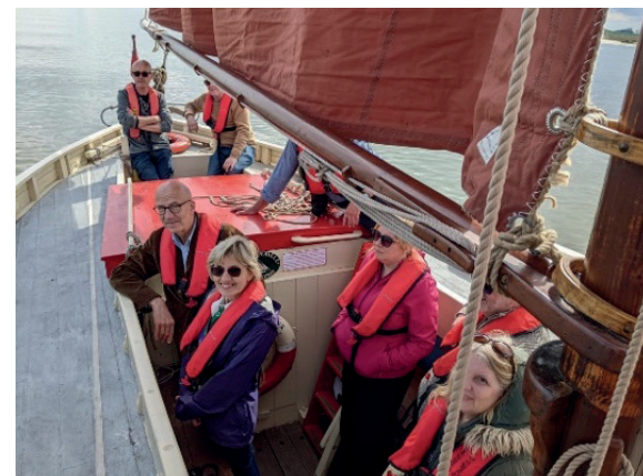
Enjoying the experience