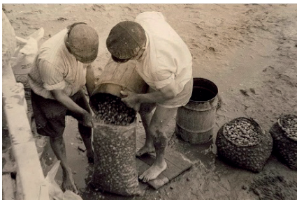
Harvesting cockles in bare feet