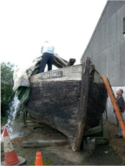
'We'll get this done in a year!'