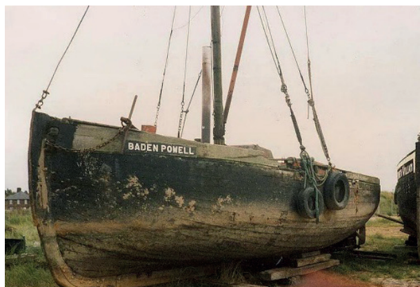
'Baden Powell' left high and dry on the quayside

Progress was very slow due to the lack of materials and funds.