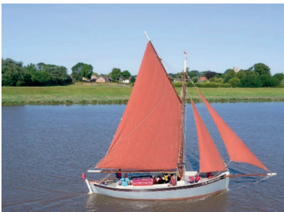
'Baden Powell' in all her glory

The total cost of restoration was more than £200,000 plus thousands of hours of volunteer blood, sweat and tears. The project could only have been achieved by a massive fundraising effort and we are grateful to the Heritage Lottery Fund, True's Yard, Adrian Flux Insurance, Associated British Ports, Teamac Paints, the King's Lynn Council, hundreds of small donations from the local community and more recently, the King's Lynn Town Guides and the Ranworth Trust for their help in keeping the Baden Powell afloat.