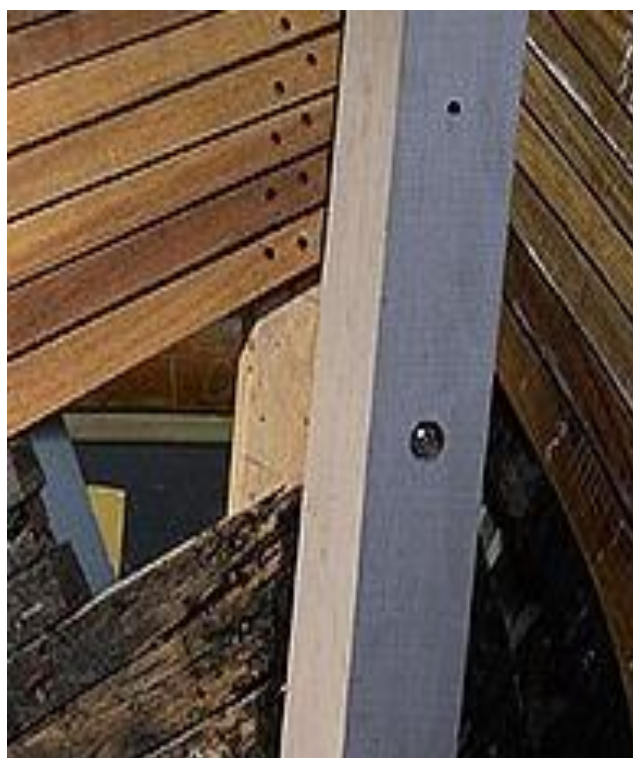
One piece off, replace it with new